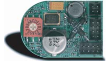
Model EZ10EN actual size